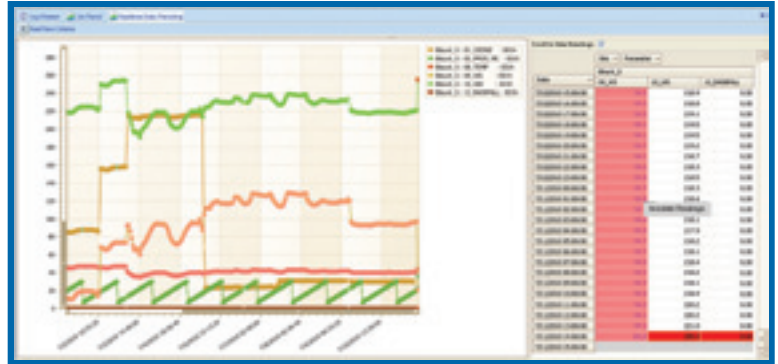
Attach memos to points of interest

Agilaire's AV-Trend Digital Strip Chart and Trending System generates graphic charts like these with just a few mouse clicks!